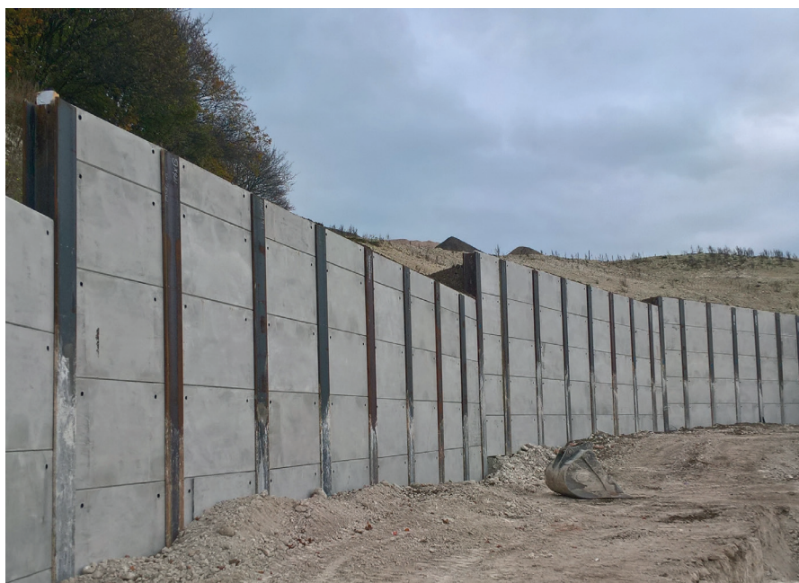
A King post wall after construction (above) and with cladding installed by others (below).